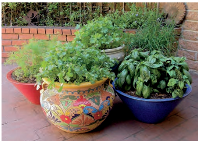
Let herbs develop flowers. Basil, oregano, thyme, and other herbs are pollinator magnets.