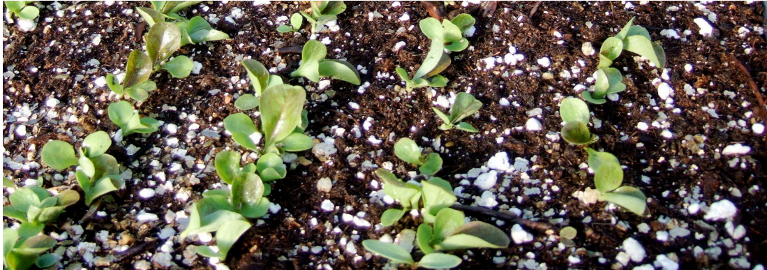
Starting seeds indoors will give you more control over variables that can cause poor germination.