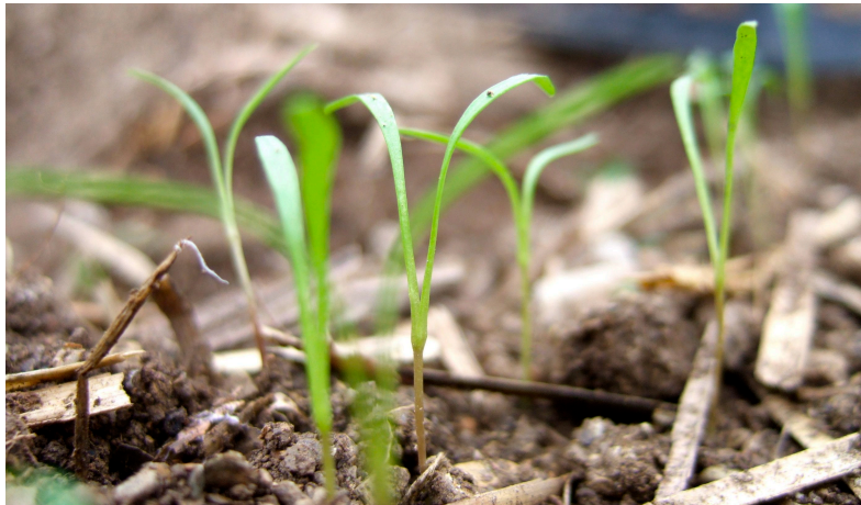
Carrot seeds can take time to germinate. Keep seedbeds moist by laying moist burlap or row cover fabric over the soil. Remove it when seedlings appear.

What is a gardener to do? For one thing, don't give up! As you build experience, your garden will flourish, and you will gain the confidence and knowledge that you need to get it right—every time.