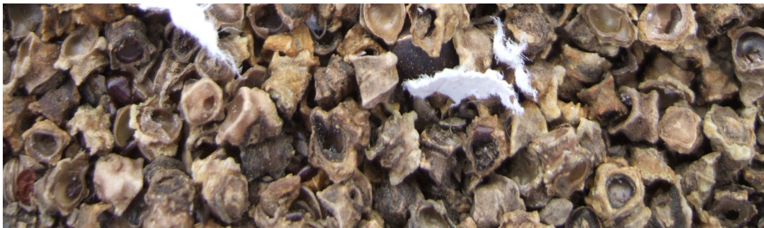
Mice can sniff out beet seeds, hollow them out, and reduce germination to almost nothing.

Solution: If some seed germinates well, but parts of a row come up empty, suspect seed- or seedling-eating insects or animals. Slugs, snails, and crickets dine on seeds and seedlings, cucumber beetles can make squash seedlings disappear overnight, and ants will carry your seeds away to their underground stash. What to do? Try a second sowing, and cover it with row cover or burlap to exclude such pests as crickets and cucumber beetles. Iron phosphate baits such as “Sluggo” and “Escar-Go!” deter slugs and snails, and are harmless to pets and people. If beet or chard germination is a problem, try setting mousetraps. For ant problems, rimming your row with baking soda or a string soaked with citrus oil may help. Or, rearrange your plantings so that direct-sown seeds are in areas with minimal ant activity.