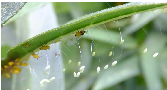
You often find delicate lacewing eggs near aphid colonies.

Lacewings are generalists, and help control a number of different insects. You might see the adults flying around your outdoor lights at night. Poor fliers, they feed on pollen, nectar, and honeydew (the sugars that