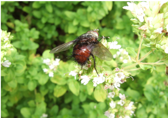
Adult tachinid flies feed on flower nectar. Larvae feed on caterpillars, squash bugs, and other pests.

The tachinid flies are an important group of insect parasitic flies, with over 1300 species in North America. Some species can easily be mistaken for houseflies, while others have prominent bristles. They are effective against a number of pests, including Japanese beetles, squash bugs, sawfly larvae, and many types of caterpillars. Some lay their eggs on leaves to be eaten by caterpillars, and others insert eggs directly into or on the outside of the host. Either way the result is the same: the eggs hatch and the maggots develop inside the host, killing it. The most obvious sign of tachinid fly activity may be the presence of oblong, white eggs glued to the top of the head or body of a host insect.