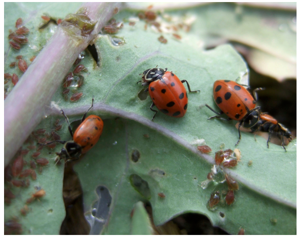
Lady beetle adults and larvae are voracious aphid eaters!

Lady beetles (commonly known as ladybugs) found in the garden are primarily aphid predators. And that's a good thing—aphid populations, if unchecked, will quickly build to damaging numbers on lettuce and other vegetables! Fortunately, populations of lady beetles tend to synchronize naturally with those of their sap-sucking prey. Both the adults and the larvae of the beetle have voracious appetites. Larvae look like small, elongated, spiny orange and black alligators, and feed for a couple of weeks before pupating and emerging, after a few days, as adults. Adult lady beetles will only stick around if their prey is still present. Otherwise, they will fly away in search of another patch of aphid-infested greenery on which to lay their eggs.