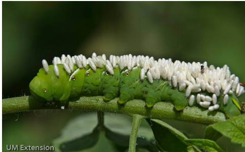
UM Extension Tomato hornworms are hosts for braconid wasp parasitoids.

Parasitic wasps comprise many species, which range in size from a tiny 1/100 of an inch to about 3/4 inch long. Parasitoids, those that kill their hosts, tend to be specialists, with each species of wasp targeting a specific host. A very visible sign of the presence of one particularly helpful type, the braconid wasp, is a